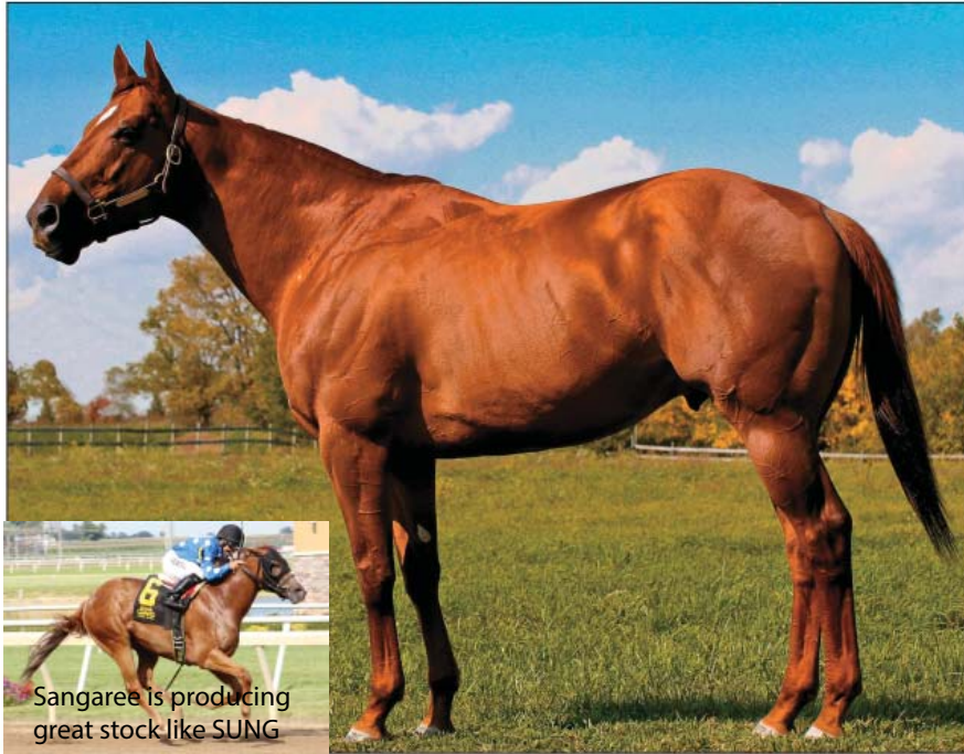
Sangaree is producing great stock like SUNG