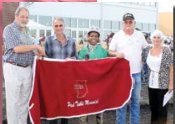
2014 Champion, Hoosier Neighbor Connections